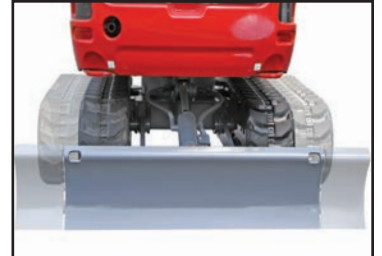
Retractable Track Frame