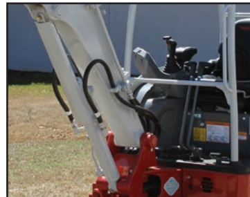
Main Boom Cylinder Guard