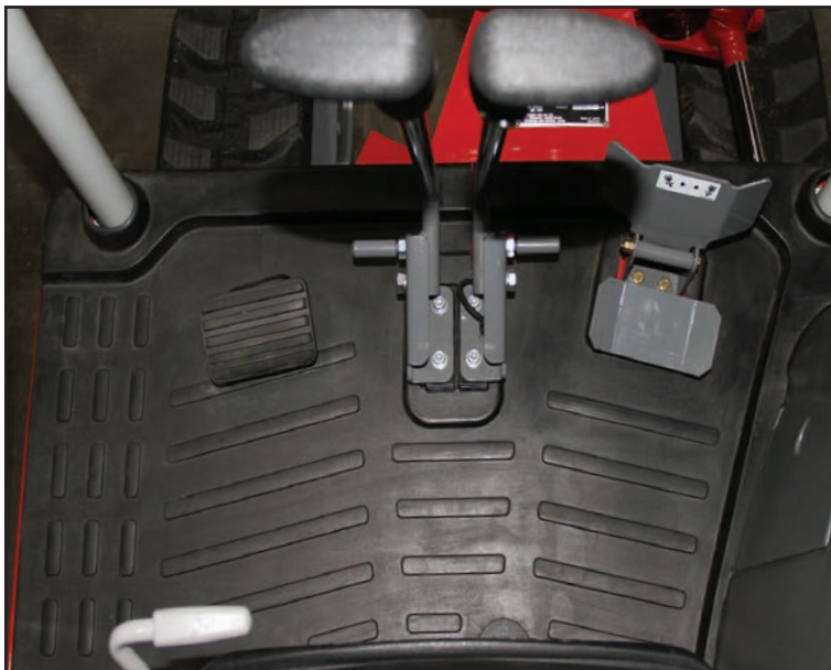
Large Flat Floor Area