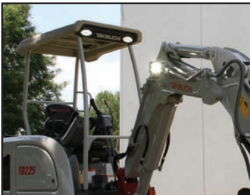
LED Work Light Package