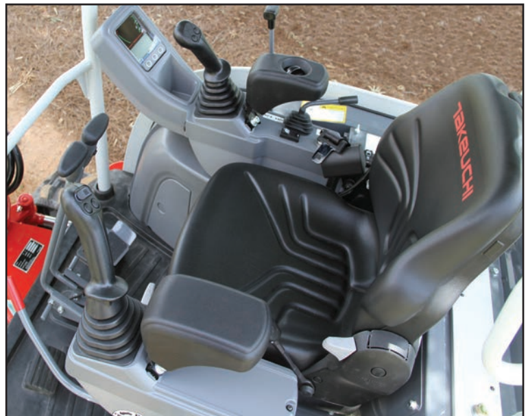
Well Equipped Operator's Station