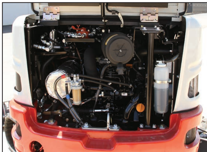
Convenient Service and Maintenance Access