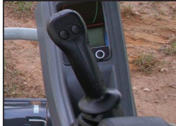
Pilot Operated Controls