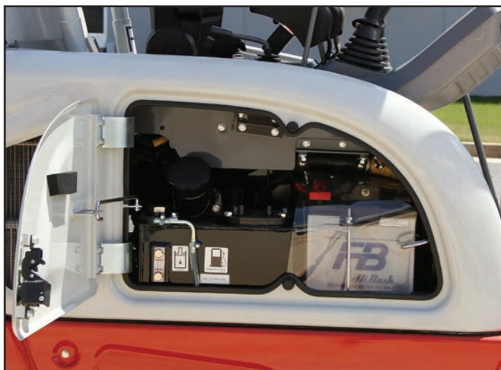
Lockable Service Door - Fuel Fill, Hydraulic Tank & Battery