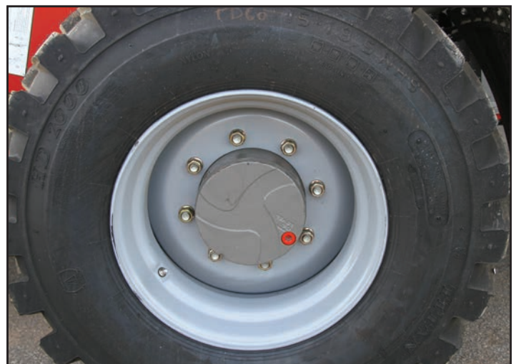
Outboard Planetary Drives