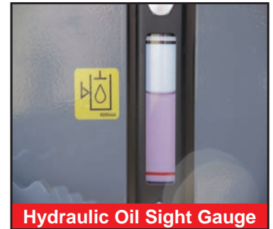
Hydraulic Oil Sight Gauge