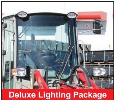
Deluxe Lighting Package