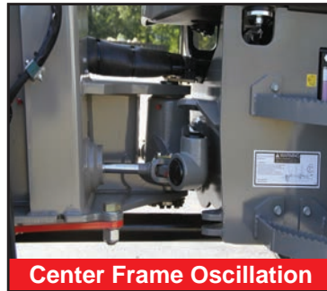
Center Frame Oscillation