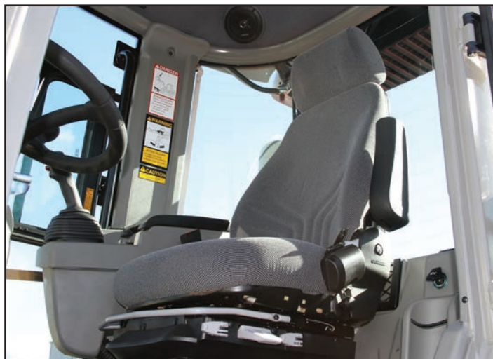
Deluxe Air Suspension Seat with Heat