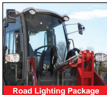
Road Lighting Package