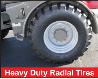
Heavy Duty Radial Tires