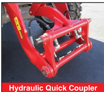
Hydraulic Quick Coupler