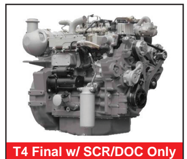
T4 Final w/ SCR/DOC Only