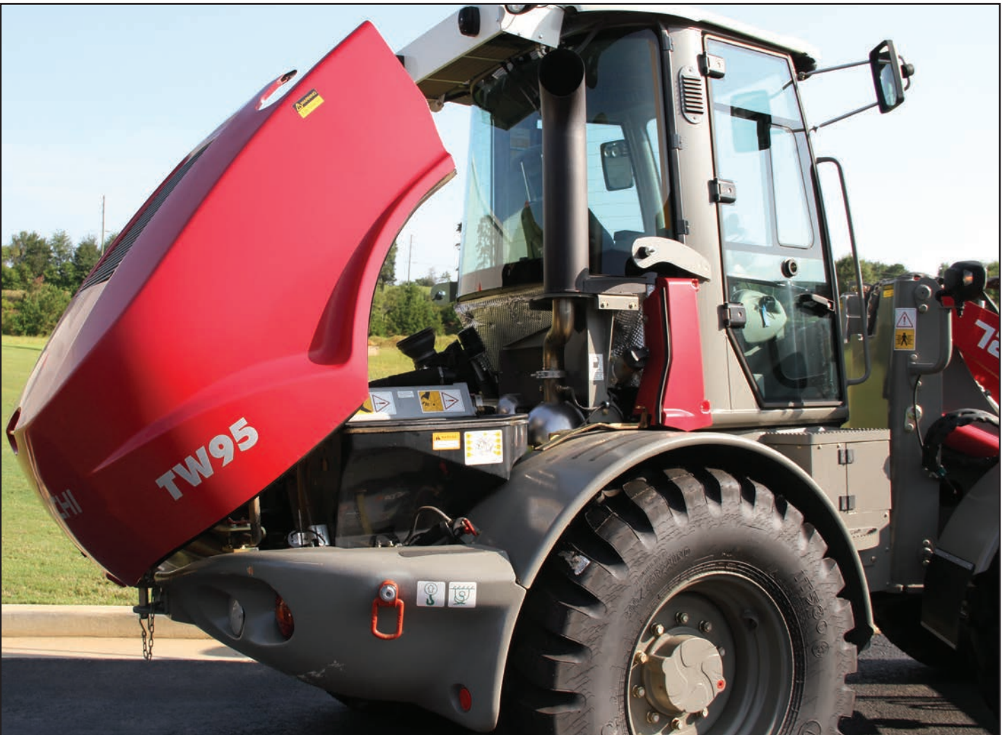
Large Lockable Rear Service Hood Provides Outstanding Service and Maintenance Access

functions. A standard hydraulic quick coupler makes changing attachments quick and efficient. The hydrostatic drive is responsive and delivers excellent power for loading applications, and it also provides dynamic braking, slowing the loader as the operator backs off the throttle. 100% locking differentials can be engaged at low speeds to provide maximum tractive effort in the most demanding conditions.