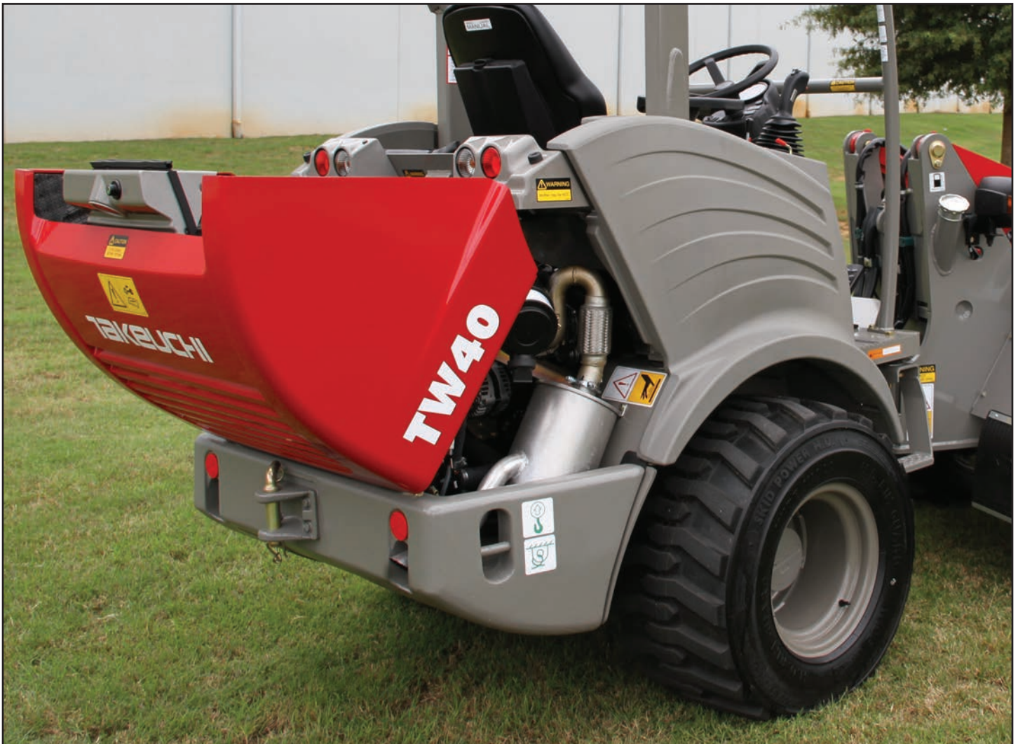
Large Lockable Rear Service Hood Provides Outstanding Service and Maintenance Access

improves attachment versatility. The operator's station is elevated and unobstructed for greater visibility and jobsite awareness. Excellent power and precise control result in increased productivity, and with lower operational and maintenance costs the TW40 is a great alternative to the skid steer loader.