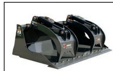
Grapple - Scrap