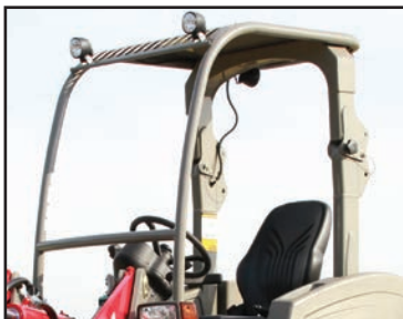
Folding ROPS / FOPS