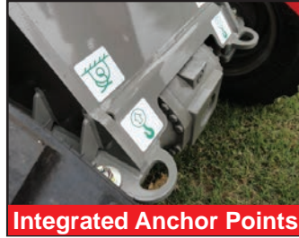
Integrated Anchor Points