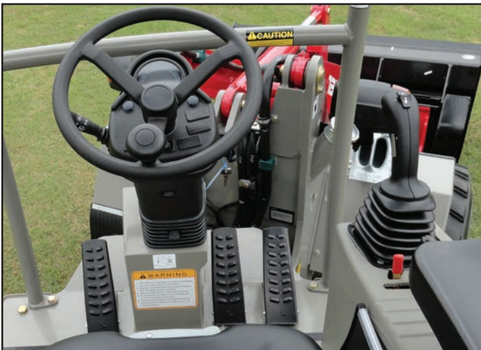
Operator's Station - Canopy