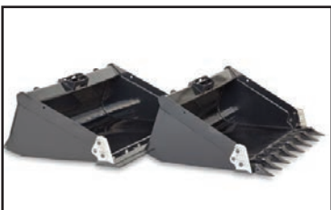
Low Profile Buckets