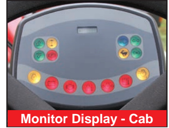
Monitor Display - Cab

The TW40 features a compact design that is ideal for maneuvering in tight spaces with minimal damage to lawns and other sensitive surfaces. Delivering 40 horsepower, the TW40 is equipped with a powerful, turbocharged Perkins engine that is Tier 4i compliant. The loader has excellent reach, dump height, and lifting capabilities making it suitable for a wide variety of applications, and the universal skid steer loader coupler greatly