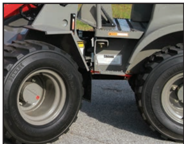
Center Frame Oscillation