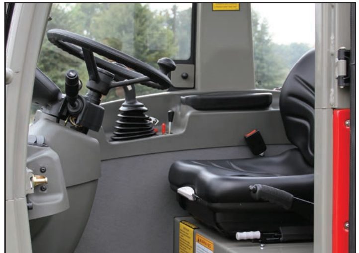
Operator's Station - Cab