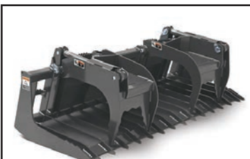
Grapple - Brush