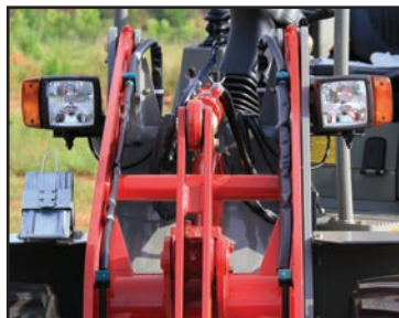
Road Lighting Package