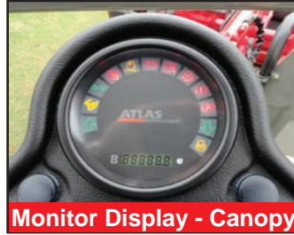
Monitor Display - Canopy