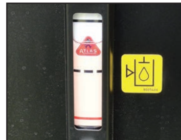
Hydraulic Oil Sight Gauge