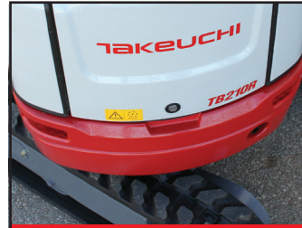
Minimal Tail Swing