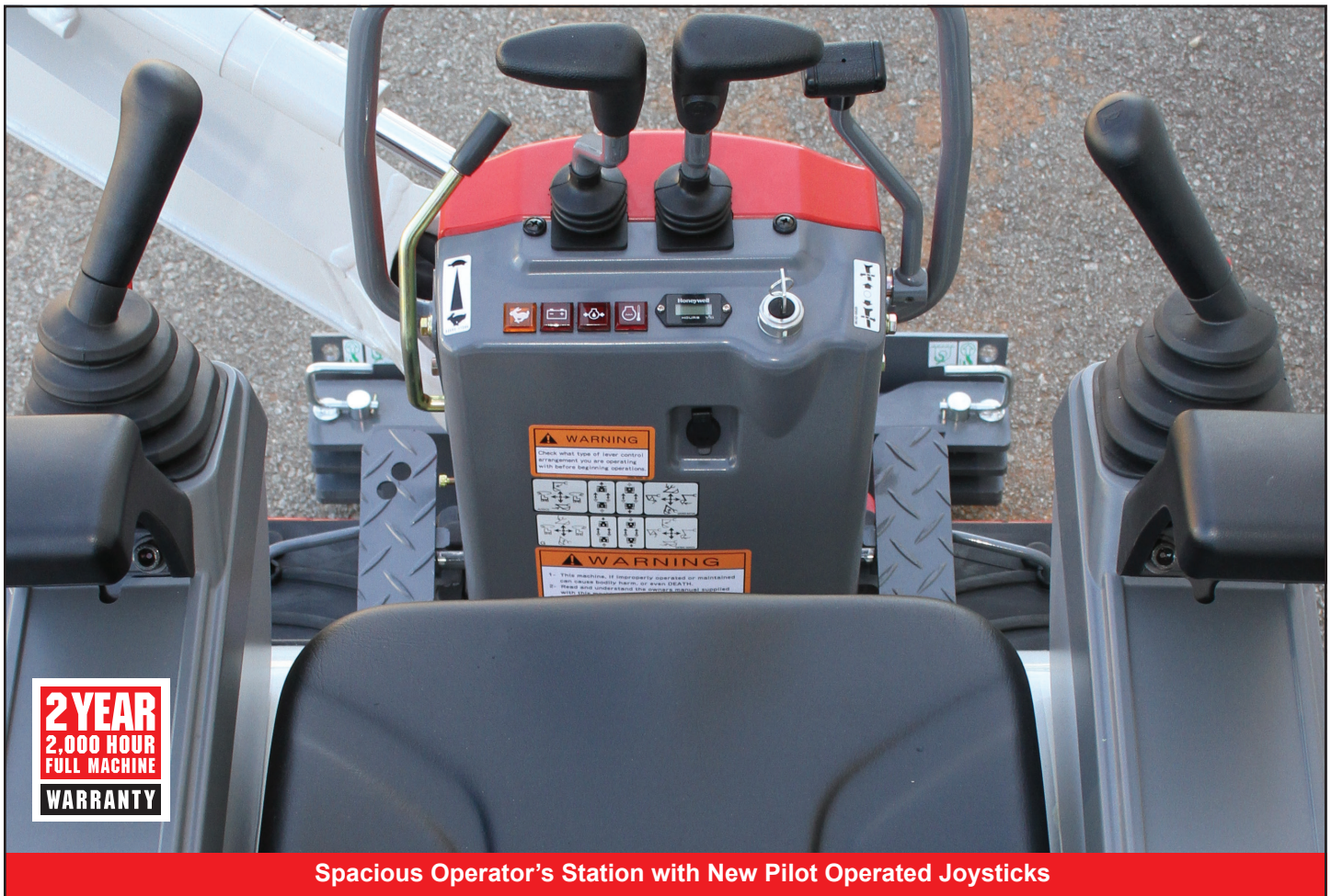
Spacious Operator's Station with New Pilot Operated Joysticks

To reduce the likelihood of rear swing impacts, the TB210R also features a short tail swing design. Despite its compact dimensions, service access is exceptional thanks to the tilt-up seat pedestal and access panels.