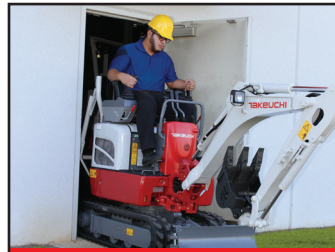
Retractable undercarriage and blade