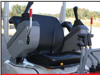
Dual side entry