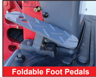
Foldable Foot Pedals